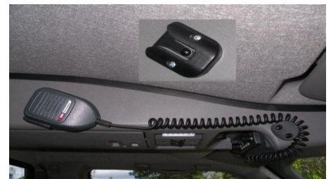
Microphone clip on acute angle