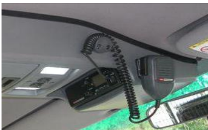
Microphone clip on slight angle

Install in a position that suits best, depending on vehicle and Radio model. Ensure microphone or microphone cable and holder does not foul on sun visor when pulled down.