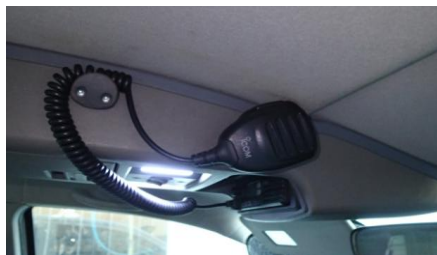
Left hand cable outlet radios